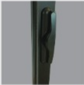
Exterior Sliding Door Handle