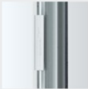
Spring Action Lock