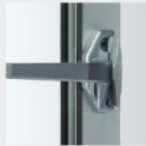
Push Out Operator