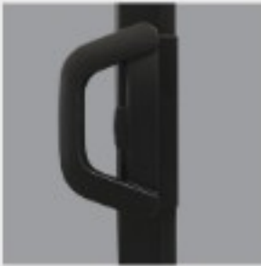
Interior Sliding Door Handle